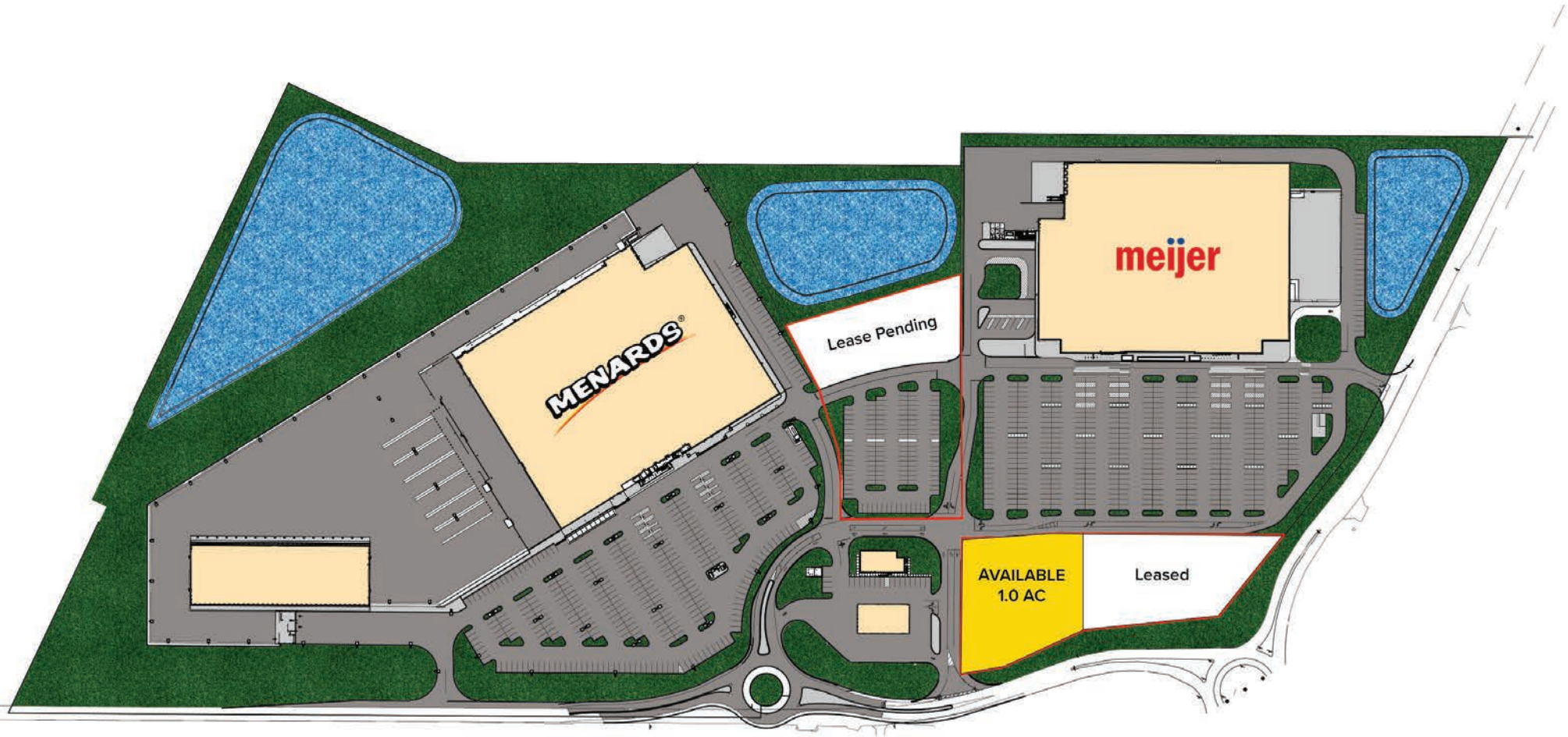
Belmont Crossings - Wooster, Oh

BELMONT CROSSING Burbank Ave. | Wooster, Ohio 44691